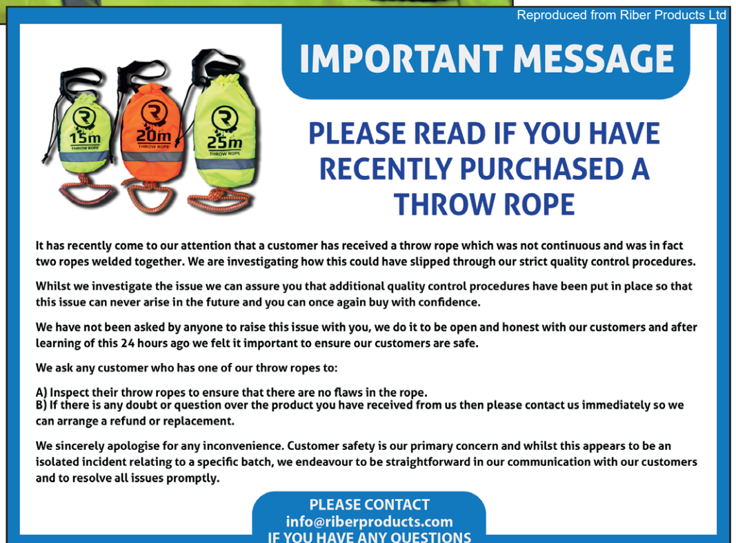
Figure 2: RIBER Customer Warning Notice on Facebook