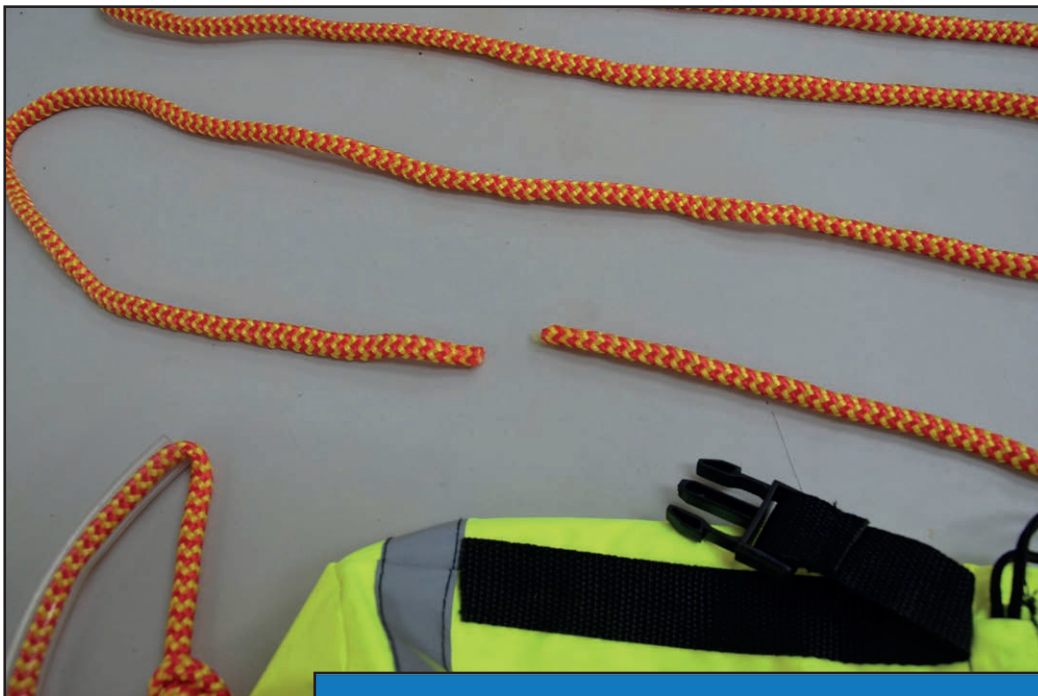
Figure 1: RIBER 15m throw bag rescue line

Considering the potentially serious consequences of a throw bag rescue line failing in a real lifesaving situation, the MAIB is conducting a safety investigation.