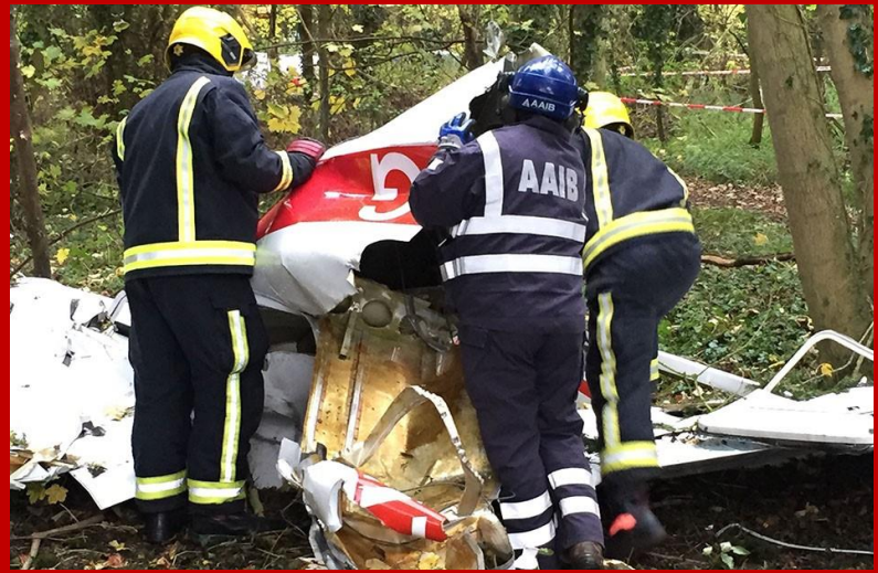
Photo: AAIB working alongside the emergency services

If you are sent to an air accident, there are some important things you need to know about how sites are managed, hazards that you might not have thought about and arrangements for conducting investigations alongside other agencies.