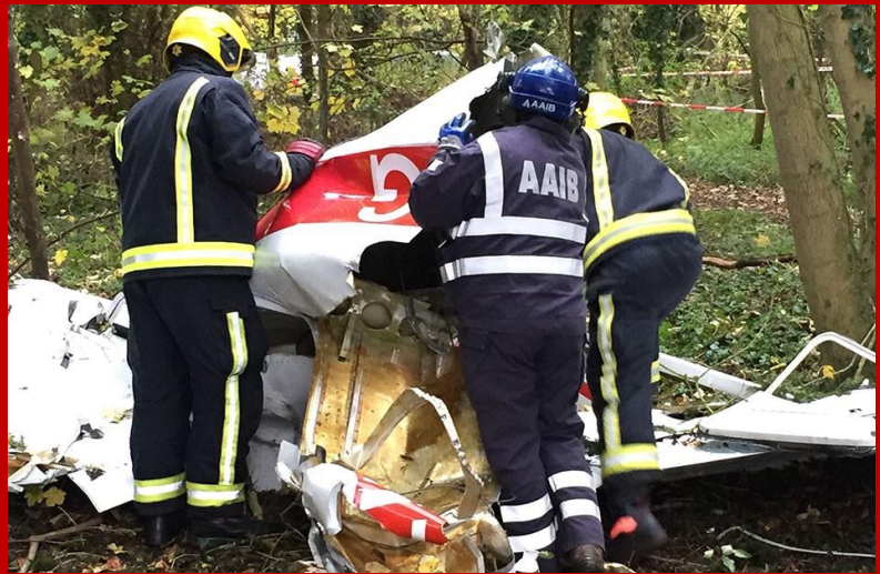
Photo: AAIB working alongside the emergency services

If you are sent to an air accident, there are some important things you need to know about how sites are managed, hazards that you might not have thought about and arrangements for conducting investigations alongside other agencies.